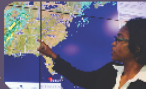
EMERGENCY MANAGEMENT TRACKS WEATHER 24/7