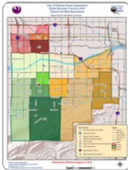
Crime Stats and Map Link

Please check it out, there is so much more information available to you online than ever before. Have some fun with it and see what new things you can learn.