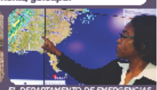
EL DEPARTAMENTO DE EMERGENCIAS MONITOREA EL CLIMA 24/7