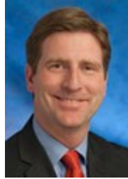
Mayor Greg Stanton