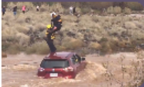
DO NOT DRIVE INTO FLOODED ROADS OR WASHES

Prepare a GO KIT , a portable pack that allows you to be self-sufficient for 72 hours after an emergency. The kit should include food, water, a flashlight, batteries, cash, first aid supplies, and medicines. Download PDF at Phoenix.gov/documents/gokit.pdf