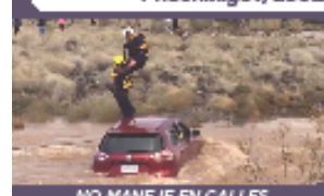
NO MANEJE EN CALLES O CAMINOS INUNDADOS

Prepare un EQUIPO DE EMERGENCIA , un paquete portable que le permita ser autosuficiente por 72 horas después de la emergencia. El equipo debe incluir comida, agua, una linterna, baterías, dinero en efectivo, suministros de primeros auxilios, y medicamentos. Descargue el documento PDF en Phoenix.gov/documents/gokit.pdf